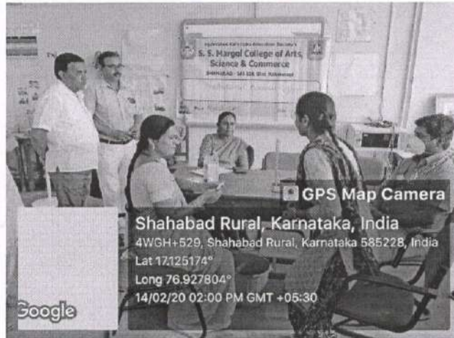
Lady Doctors are inspecting the health of checkup for students